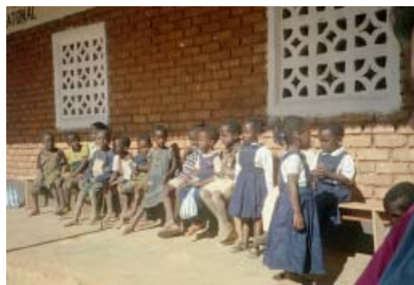
HYFOM students, Katumbi

Both HYFOM and the Katowa TDC send their American friends a huge YEWO CHEMENE/ ZIKOMO KWAMBIRI (Thank you) for their generous support of the children and community of Katumbi. Thank you!