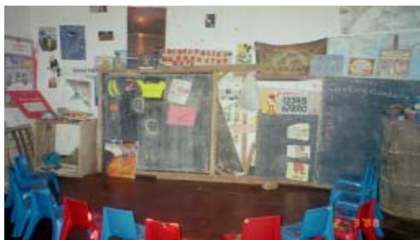
HYFOM classroom, Katumbi

The very small village of Katumbi, is in a valley at the bottom of the Nyika Plateau. It is a beautiful place, but impoverished, as is most of Malawi. On the outskirts of the village, is a bright and