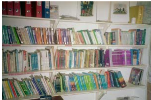
Katowa TDC Library, Katumbi